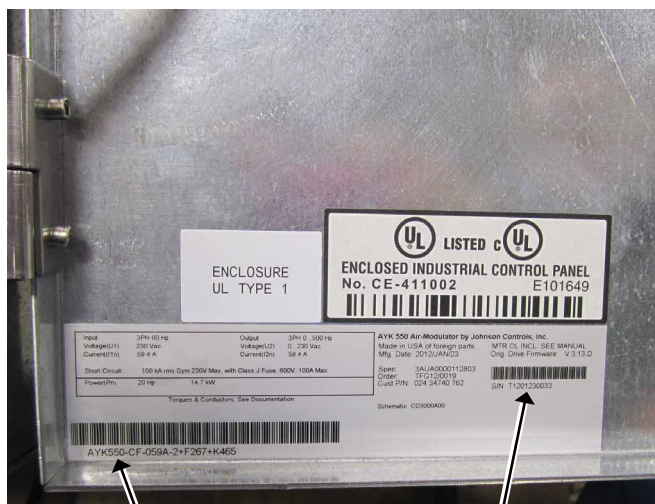
Unit (Cabinet) Model Number Unit (Cabinet) Serial Number