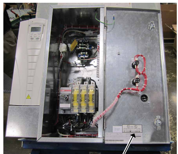
Location of Product Identification Label (inside cabinet door)