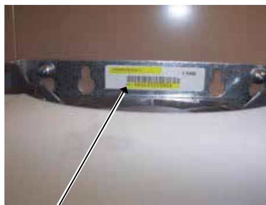
Top of drive

Work on this equipment should only be done by properly trained personnel who are qualified to work on this type of equipment. Failure to comply with this requirement could expose the worker, the equipment and the building and its inhabitants to the risk of injury or property damage.