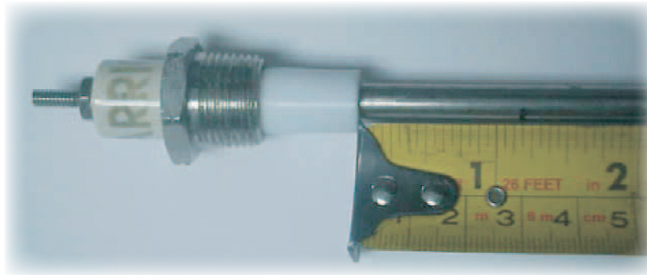
FIG. 2 – REFRIGERANT FLOAT SWITCH