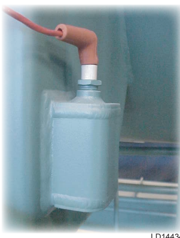
FIG. 1 – REFRIGERANT FLOAT SWITCH (1F)

The new style switch can be identified by the smaller threaded connection on the top of the enclosure box; this connection is a 3/8" NPT connection. The "spark plug" looking wiring harness is red in color (see FIG.1).