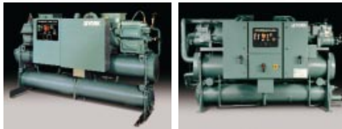
Small-Tonnage Water-Cooled Chillers