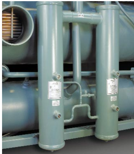
Two oil separators per refrigerant circuit provide complete oil/refrigerant separation.