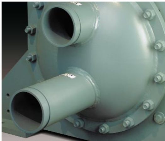
Victualic grooved water connections. Clamp-connect designs eliminate the need for on-site pipe welding.

Remote condensing allows you to dispense with the cooling tower and its associated pipework. If you need to eliminate the cost and maintenance associated with a cooling tower, or your building cannot support the rooftop installation of a chiller, remote condensing offers an alternative solution.