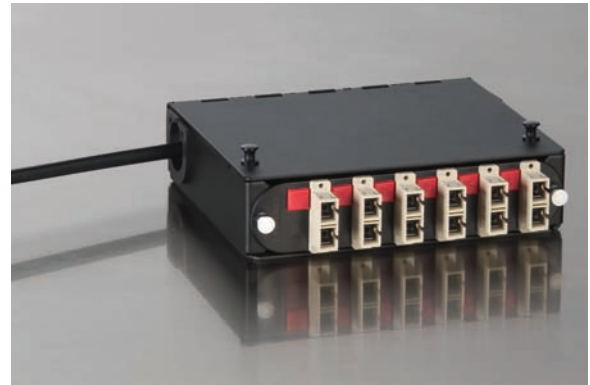
Single-Panel Housing with SC Duplex Adapters | Photo LAN670