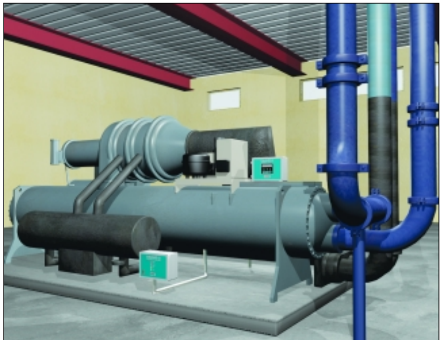
Figure 1: A single chiller located in the mechanical room. The Chillgard LS Monitor(s) is located near the floor for detection of the refrigerant gas. The LC Module is located at eye level providing gas concentration and alarm indication. (Chillgard LS Monitor can exist as a stand-alone monitor.)