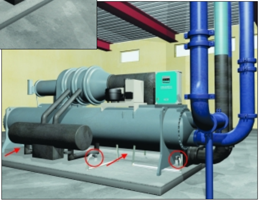
Figure 4: A Chillgard LE Monitor is located in the mechanical room providing integrated sensing and controlling. Up to four points of monitoring provide for maximum protection around the chiller.