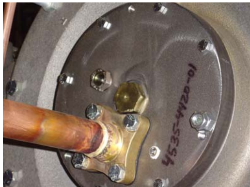
Figure 6. New design Bearing Inspection Cover with new design Grounding Brush installed.