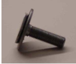
Figure 3. New Design Grounding Brush