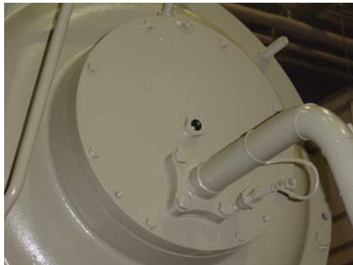
Figure 5. New design Bearing Inspection Cover with brush fitting, but without the brush installed. This cover is standard on LF 2.0 equipped chillers since 9/24/2004.