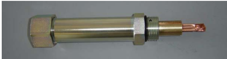
Figure 4. Original Bearing Inspection Cover without brush fitting or brush.