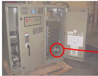
Figure 1. LF 2 Drive Identification