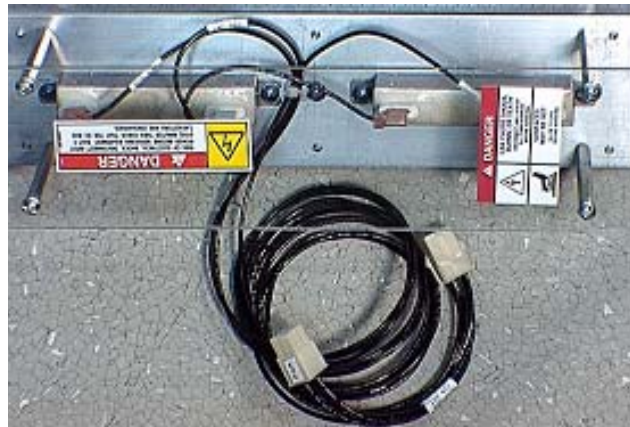
Figure 3. Example Field Resistor Repair Kit is shown below. Style/layout may vary to accommodate Drive Enclosure sizes.