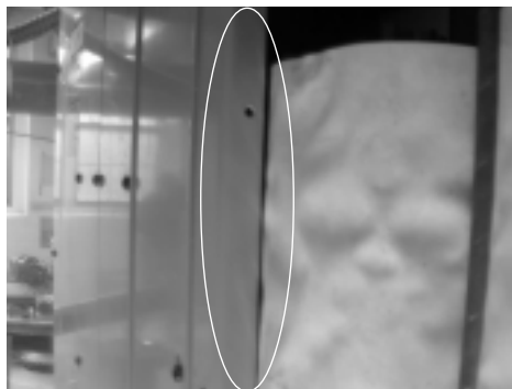
Figure 2. Illustration with no clearance. View is from rear of drive. Back cover removed.

It is desired to have 3/16" (4.75mm) to 1/2" (12.7mm) between the inductor and the u-channel. Refer to Figure 2.