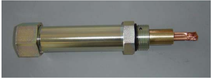
Figure 4. Original Bearing Inspection Cover without brush fitting or brush.