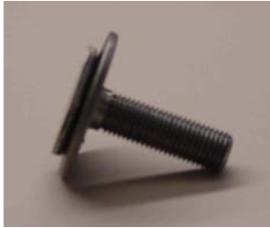
Figure 2. Rotor grounding bolt and washer