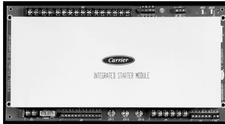
ISM (INTEGRATED STARTER MODULE)

The ISM mounted in all motor starter types except Benshaw Inc. solid state starters* contains the following features: