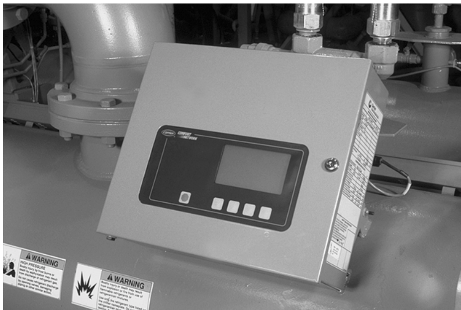
PIC II CONTROL PANEL WITH CVC (CHILLER VISUAL CONTROLLER)

The CVC mounted in the control panel contains the following features: