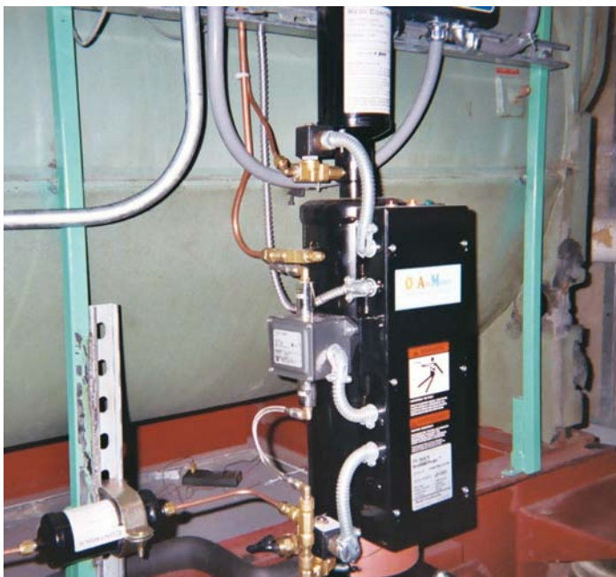
The OAM Purger is installed on chillers and removes oil, acids, and moisture even when the chiller is idle.

oil,” he said. “Two were in a BP office building and the other in the Frontier office tower. They all had been losing capacity over time. The No. 1 chiller in the BP building, a 275-ton unit, was running at 100 percent load on a 65-degree day, and we had to bring the second on line to maintain temperature.”