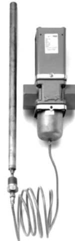
V47 Series Valve