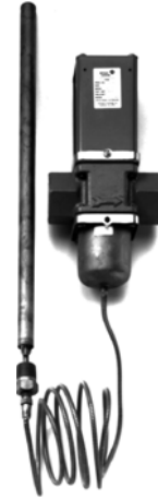
V47 Series Valve

If the V47 Series Temperature Actuated Modulating Valve fails to operate within its specifications, replace the unit. For a replacement valve, contact the nearest Johnson Controls® representative.