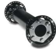
TurboFlex HP by Bibby